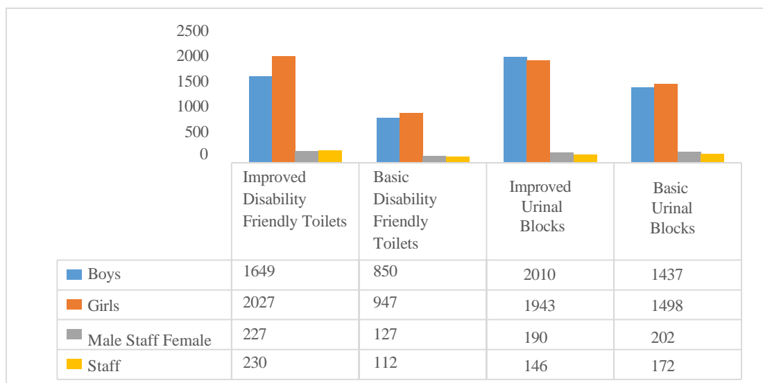
Figure 6: Number of disability-friendly toilets as of 2022

73. In transition towards fully implementing inclusive education, special needs schools have been transformed into resource centres which serve learners with special education needs as institutional settings attached to primary, secondary or higher education institutions. As of 2019, there were 140 primary and 37 secondary resource centres. Some communities have also mobilized resources to set up resource centres for persons with disabilities attached to local regular schools, such as Gumbo Resource Centre in Ntcheu District and Migowi Resource Centre in Phalombe District.