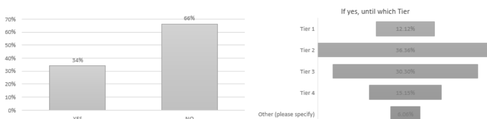
Figure 6. Traceability of the value chain in the garment and footwear sector

[In the left graph, other refers to Chemical Suppliers]