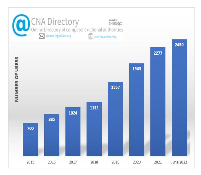
Figure II Number of users of the directory of competent national authorities, 2015–2022

20. Since the tenth session of the Conference of the Parties, the number of registered users of the directory also increased, reaching 2,450 users overall as at June 2022 (see figure II).